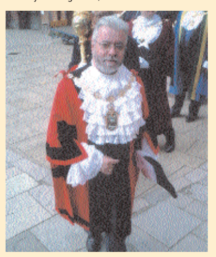
The Mayor of Waltham Forest