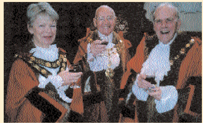
The Mayors of Richmond, Hillingdon & Havering