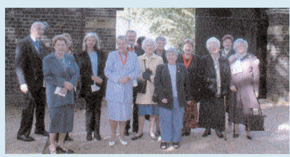
(Above) Members congregate outside the gates to Clarence House