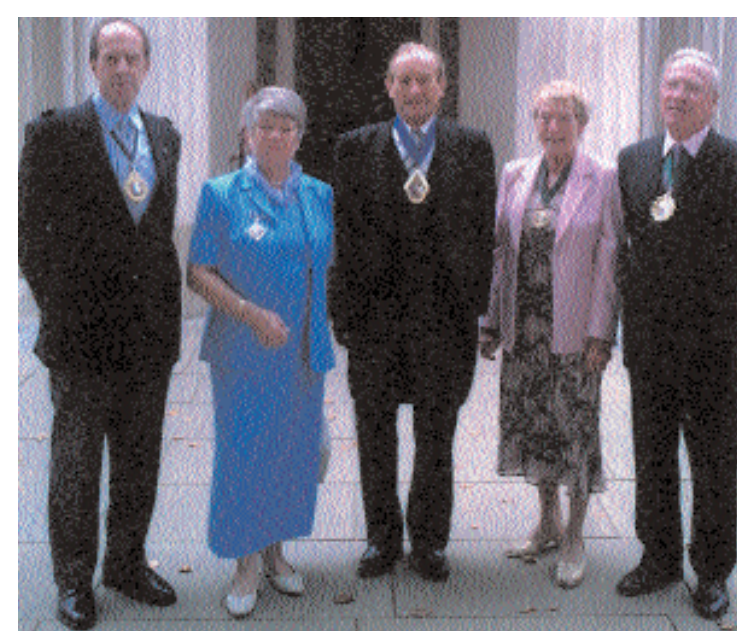
The Mayor & Mayoress of Kingston Upon Thames, The Mayor of Kensington & Chelsea & the Mayor & Mayoress of Sutton

The evening began with a fascinating lecture by one of the curators followed by a leisurely tour of the magnificent artifacts and paintings in the stunning Galleries.