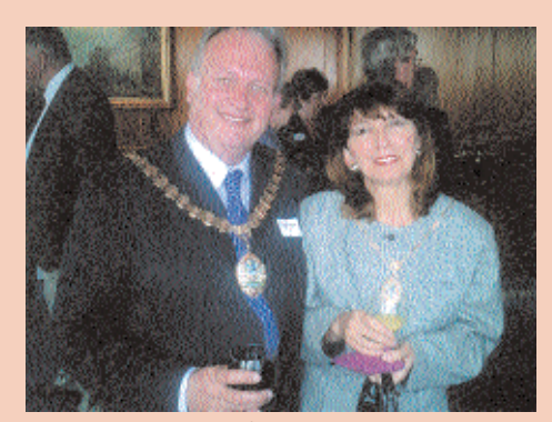
The Mayor and Mayoress of Hounslow

Shortly after the round of Mayor Making Ceremonies, the Lord Mayor of Westminster, Cllr Jan Prendergast, continued the new tradition of jointly with the London Mayors' Association inviting all the newly elected Mayors of