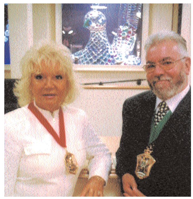
The Mayors of Merton & Waltham Forrest