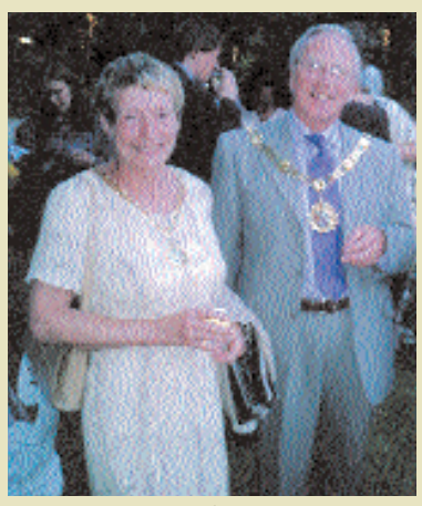
The Mayor & Mayoress of Sutton

There is no better way to spend a balmy summer's evening in July, than in the Open Air Theatre in Regent's Park. And so the visit of the London Mayors' Association was a wonderfully enjoyable occasion. Starting with supper and Pimms on the picnic lawn during a lovely sunny summer evening, the production of Shakespeare's Two Gentlemen of Verona