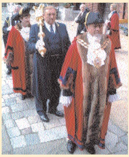
The Speaker of Hackney followed by the Mayor of Greenwich