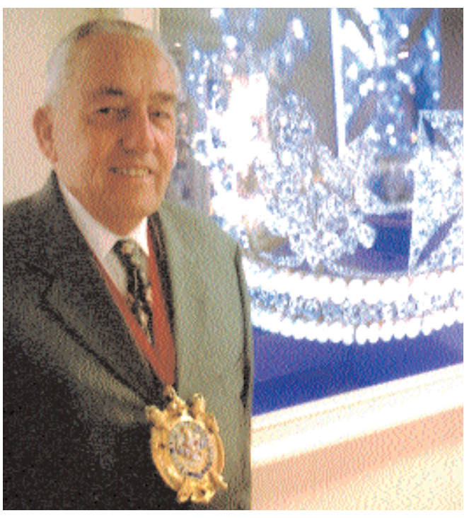
The Mayor of Hammersmith & Fulham

Inside: New Mayors' Reception • Civic Service • Clarence House Visit