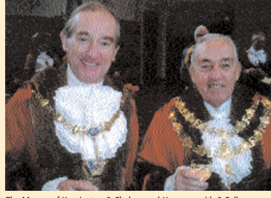
The Mayors of Kensington & Chelsea and Hammersmith & Fulham enjoy the post Service Reception