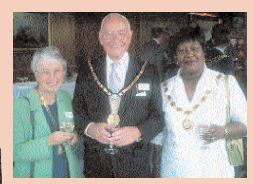
The Mayoress of Brent, the Mayor of Hillingdon & the Civic Ambassador of Newham