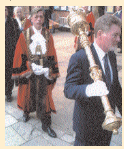
The Mayor of Lambeth preceded by his Macebearer