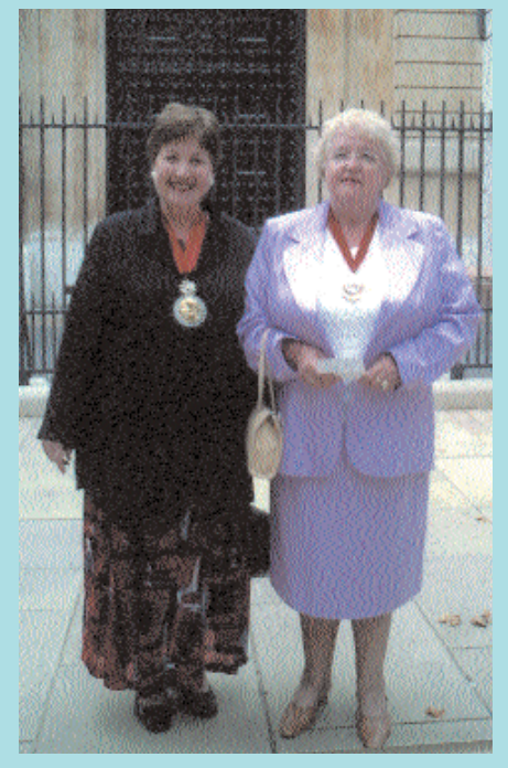
The Mayor of Greenwich & the Civic Ambassador or Newham

After the tour of the Queen's Gallery, Members adjourned to Westminster City Hall for a very enjoyable Dinner.